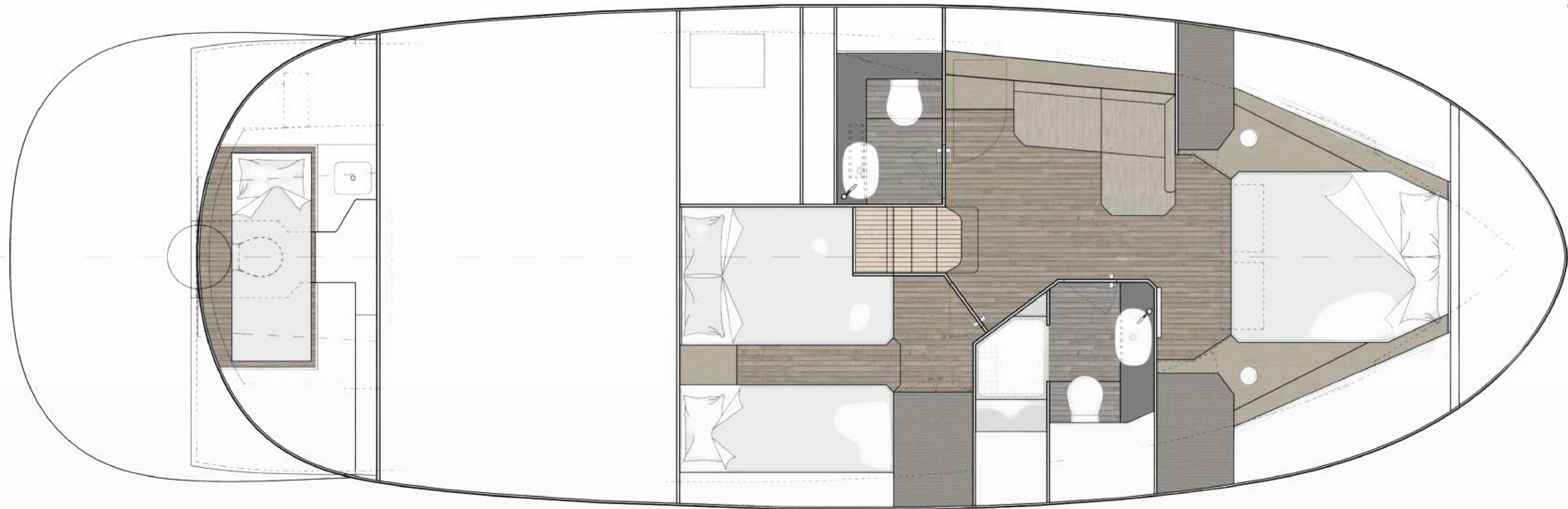
LOWER DECK opt. A